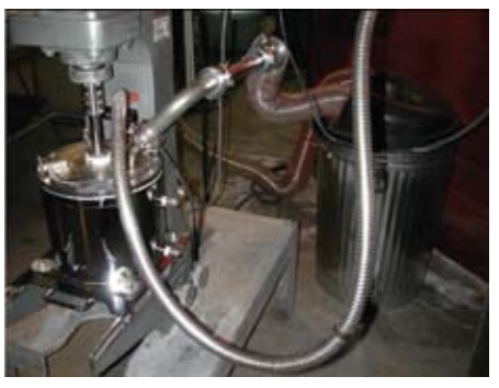
Figure 5. Vapor recovery system and special mill covers must be used with cryogenic milling.

For additional information regarding media milling, contact Union Process Inc., 1925 Akron Peninsula Rd., Akron, OH 44313; (330) 929-3333; fax (330) 929-3034; e-mail unionprocess@unionprocess.com; or visit www.unionprocess.com.