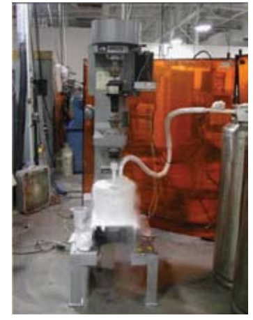
Figure 4. A research attritor being used with a cryogen.