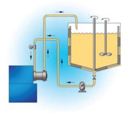
Figure 2. This mill was developed to combine advantages of circulation grinding with small media.

Cryomilling is a variation of mechanical milling in which powders are milled in a cryogen slurry (usually liquid nitrogen) or at a cryogen temperature under processing parameters such that a nano-structured microstructure is attained.<sup>1</sup> Figure 4 shows a research attritor being used with a cryogen at Advanced Ceramics Research