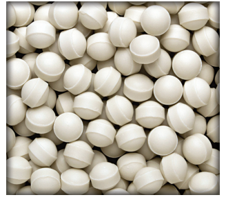
CERAMIC (STEATITE) SATELLITES