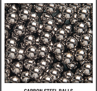
CARBON STEEL BALLS