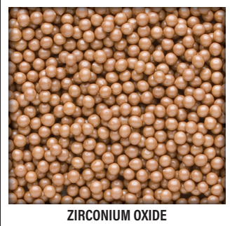
(CEO2 STABILIZED) BEADS