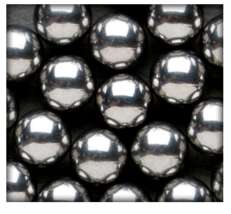
STAINLESS STEEL BALLS