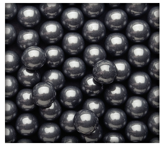
SILICON CARBIDE BALLS