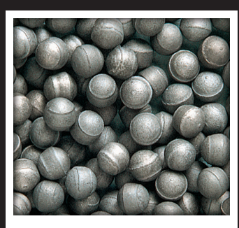
TUNGSTEN CARBIDE SATELLITES