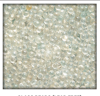
GLASS BEADS (LEAD FREE)