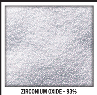
(Y203 STABILIZED) BEADS