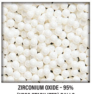
(Y203 STABILIZED) BALLS