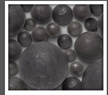
FORGED STEEL BALLS